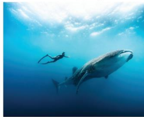
The Maldives Various families flock to the Maldives for a remote office experience at one of the earth's most scenic escapes, located in the UN World Heritage Biosphere Reserve, Soneva Fushi is a remote 70 private villas, including recently renovated 1,500-square-foot one-bedroom and 2,500-square-foot two-bedroom villas—the largest one- and two-bedroom oceanfront villas in the world. The villas include water slides that lead directly to the ocean, movie studios, hammocks and master bedrooms with terraced decks. The resort is a year-round office retreat, guests have access to things like high-speed internet and daily yoga and meditation, along with off-the-chart work and play experiences like Soneva in Aqua, a 100-cabin yacht that comes with an onboard library and a desert island picnic excursion on the Caanoo, Office on the sandbank with a private chef weekly, and more. Kids stay occupied with private tutoring through Openplan Education, a U.K.-based tutoring company, and a variety of learning-inspired activities administered by the resort's marine biologist, environmental and permaculture specialists. From 30-night stays from $15,000, 30-night stays from $25,000, soneva.com