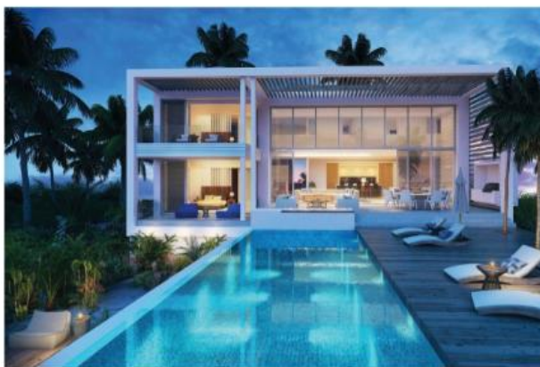
Providenciales, Turks and Caicos Shimmering turquoise water, white sand beaches and a safe, socially distanced live-work environment beckon with Beach Enclave Turks and Caicos' new long-term stay package. In addition to booking luxuriously appointed 1-acre villas in private, gated communities at Long Bay, North Shore and Grace Bay Beach (opening this winter), professionally minded services such as a personal assistant and a full-time nanny for families are also available to help make the transition from a pre-COVID workplace to a remote workplace easy. Other perks include a $2,500 resort credit per month, a personal butler, concierge services, daily breakfast, housekeeping, group yoga and more. Thirty-night stays from $75,000, beachenclave.com