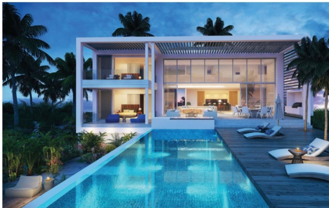
Providenciales, Turks and Caicos Shimmering turquoise water, white sand beaches and a safe, socially distanced live-work environment beckon with Beach Enclave Turks and Caicos' new long-term stay package. In addition to booking luxuriously appointed 1-acre villas in private, gated communities at Long Bay, North Shore and Grace Bay Beach (opening this winter), professionally minded services such as a personal assistant and a full-time nanny for families are also available to help make the transition from a pre-COVID workplace to a remote workplace easy. Other perks include a $2,500 resort credit per month, a personal butler, concierge services, daily breakfast, housekeeping, group yoga and more. Thirty-night stays from $75,000, beachenclave.com