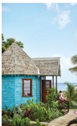
Ocauchessa, Jamaica Inspiration is up for grabs in Ocauchessa, a quiet fishing village in Jamaica that's attracted notable creatives over the years. Currently owned by Chris Blackwell, founder of Island Records, GoldenEye—a collection of beach villas, luxury cottages and beach bars—are a hotly pursued destination with a laptop and satellite beaches—served as first Fleming's home and is the site where he wrote all 14 James Bond novels. Guests booking a 30-night-plus stay on the private estate will receive a weekend stay along with unlimited laundry service and daily breakfast. Also available to book is the author's original five-bedroom home, where his writing desk still remains. Thirty-night stays from $10,000, goldeneye.com