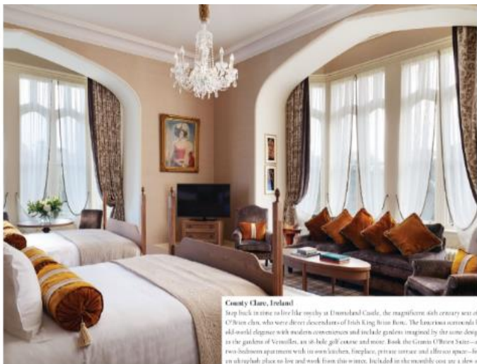
County Clare, Ireland Step back in time to live like royalty at Unweald Castle, the magnificent sixth century seat of the O'Brien clan, who were direct descendants of Irish King Brian Boru. The luxurious six-room hotel blends old-world elegance with modern amenities and include gardens designed by the same designer as the gardens of Versailles, an 18-hole golf course and more. Book the Grand O'Brien Suite—a two-bedroom apartment with its own kitchen, fireplace, private terrace and office space—like an elite club place to live and work from this winter. Included in the monthly rate are a slew of amenities: unlimited laundry, daily breakfast, 24/7 IT support for setting up and maintaining a home office, and a personal limo. Thirty-night stays from approximately $14,000, downlast.ie