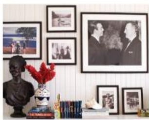
County Clare, Ireland A tastefully appointed executive office in Unweald Castle in County Clare, Ireland, is GoldenEye's business, personal and a state-of-the-art home office for Fleming's former boss, which has a conference call-in with one of the most powerful work environments and productivity services.